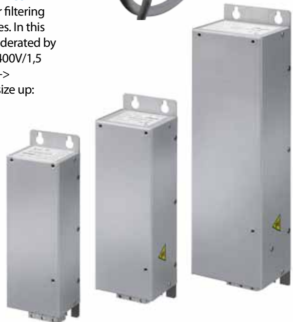
Frame sizes Three different frame sizes of line filters correspond to the M1, M2 and M3 enclosures of the VLT® Micro Drive